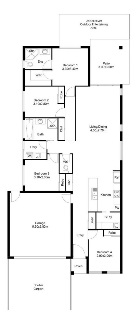
SIZES AND DIMENSIONS ARE APPROXIMATE, ACTUAL MAY VARY.